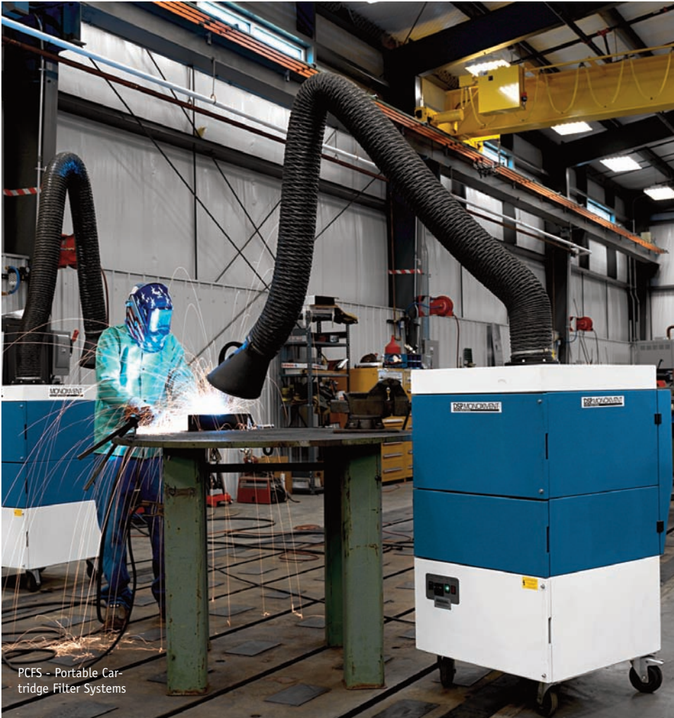
PCFS - Portable Cartridge Filter Systems