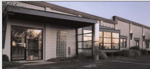
Fabrication/Manufacturing Facility (above) and Corporate Office Facility (below)